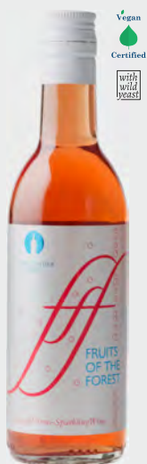
FRUITS OF THE FOREST VARIETAL WINE SWEET SEMI SPARKLING — 187ml —