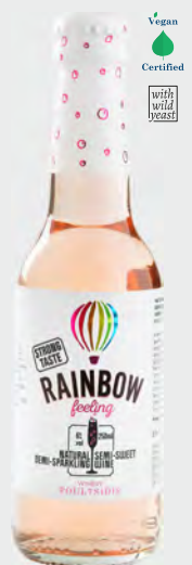
RAINBOW FEELING VARIETAL WINE NATURAL SEMI-SWEET SPARKLING — 250ml —