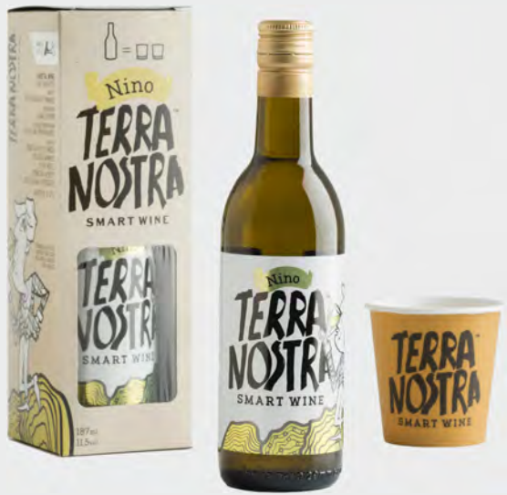
TERRA NOSTRA WHITE

In a unique package with a craft paper cup.