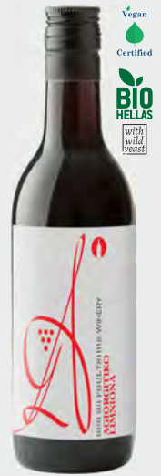
KARYOS GAEA red