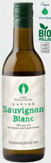
KARYOS GAEA white