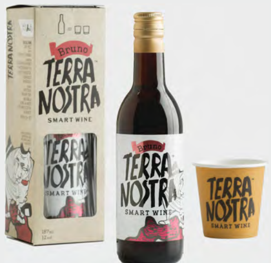
TERRA NOSTRA RED