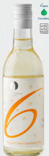
SIXTH SENSE VARIETAL WINE WHITE SEMI-DRY SPARKLING — 187ml —