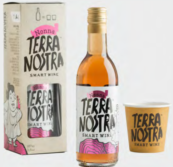
TERRA NOSTRA ROSÉ