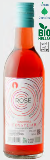
KARYOS GAEA rosé