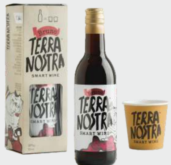
TERRA NOSTRA RED