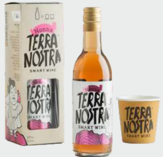
TERRA NOSTRA ROSÉ

In a unique package with a craft paper cup.