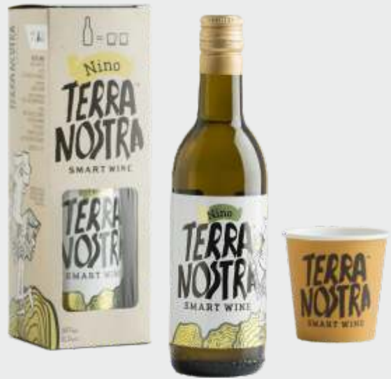
TERRA NOSTRA WHITE